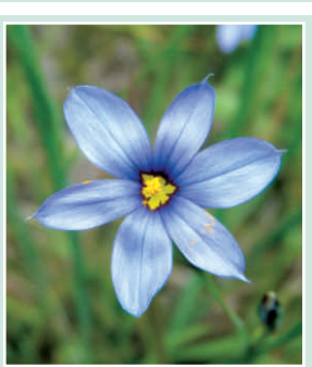
Coastal Plain Blue-Eyed Grass Flower

NS General Status Rank: Secure ■◆■ Distribution: NS, NB, QC, ON Stems flatter and broadly winged, 2.5-4 mm wide.